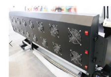
Dual integrated IR & cooling fan system,meet the drying needs of high-speed printing.