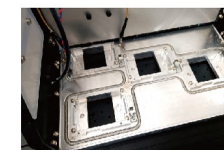
Increase the bottom heating of the carriage which can improve printing stability.