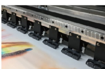
New independently adjustable three-stage pinch roller brings more stable feeding precision.