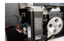
New high quality DC servo motor with good stability and long life.