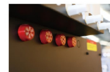
Bulky ink bottle with lack of ink alarm system represents the advanced concept of industrial application.