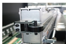
High-precision and high-stability tensioning pulley system.