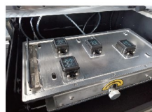
Automatic moisturizing cleaning assembly ensures the stability of head cleaning and improves working stability.