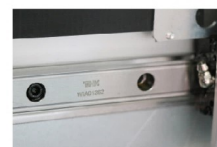
THK high-precision mute rail.