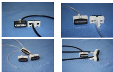
Capping: M.O.Q 50pcs: Roland, Mutoh, Mimaki printer (Epson DX4 printhead)