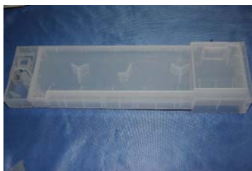
440ml empty cartridge: M.O.Q 50pcs: