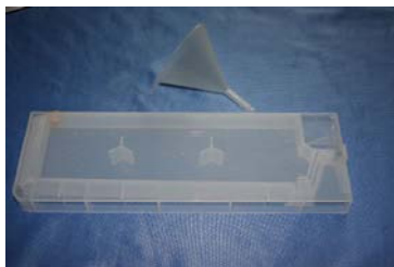
220ml empty cartridge: M.O.Q 50pcs: