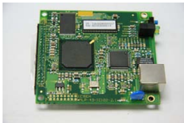
Roland network board(OEM): Roland FJ540/740