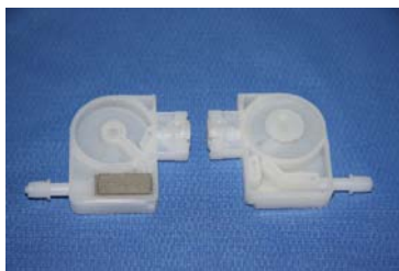
Epson DX5 damper : M.O.Q 50pcs: Epson Stylus Pro 9800/9400/7800/7880 7400/7450/4800/4400/4000/1800/1900