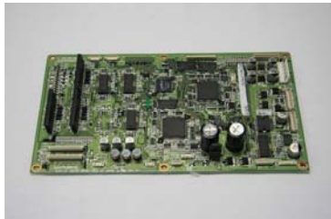
Roland original servo board: Roland FJ540/600/740