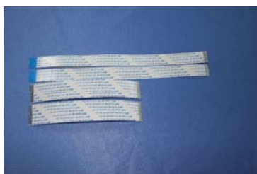
Epson DX4 printhead cable: M.O.Q 100pcs: Roland, Mutoh, Mimaki printer(Epson DX4 printhead)