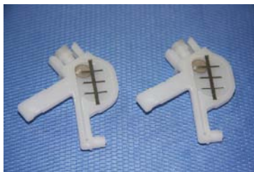
Epson DX5 damper: M.O.Q 50pcs: Epson Stylus 9600/7600