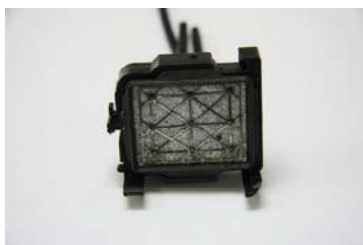
DX5 capping: M.O.Q 50pcs: Mutoh ValueJet1204/1604/2606/RJ900C