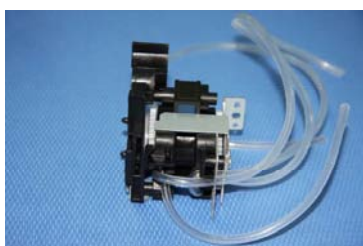
solvent resistant pump: M.O.Q 50pcs: Roland, Mutoh, Mimaki printer(Epson DX4 printhead)