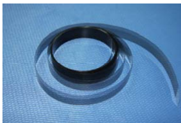
Imported raster: M.O.Q 50pcs: Local raster: M.O.Q 50pcs: