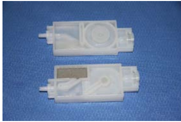
Mimaki JV33/JV5 damper: M.O.Q 50pcs: