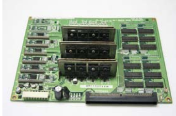
Roland original printhead board: Roland printhead board(OEM): Roland FJ540/600/740