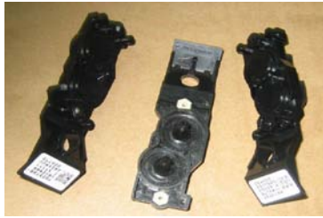
DX4 printhead top: solvent resistant M.O.Q 50m: